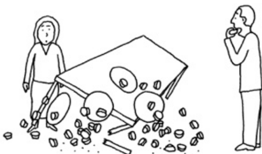
TABLES BUCKLING UNDER SHEER WEIGHT OF MINCE PIES