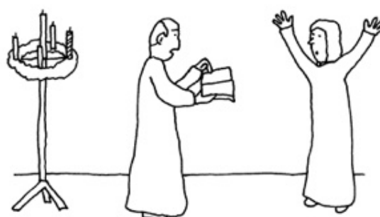
UNREST OVER THE CORRECT WEEK TO LIGHT THE PINK CANDLE