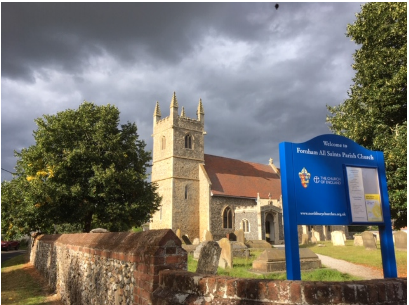
Sunshine showers and shadows at Fornham All Saints

Please forward this to anyone you know who might not be in our Google group. For links to information about us please visit: www.northburychurches.org.uk