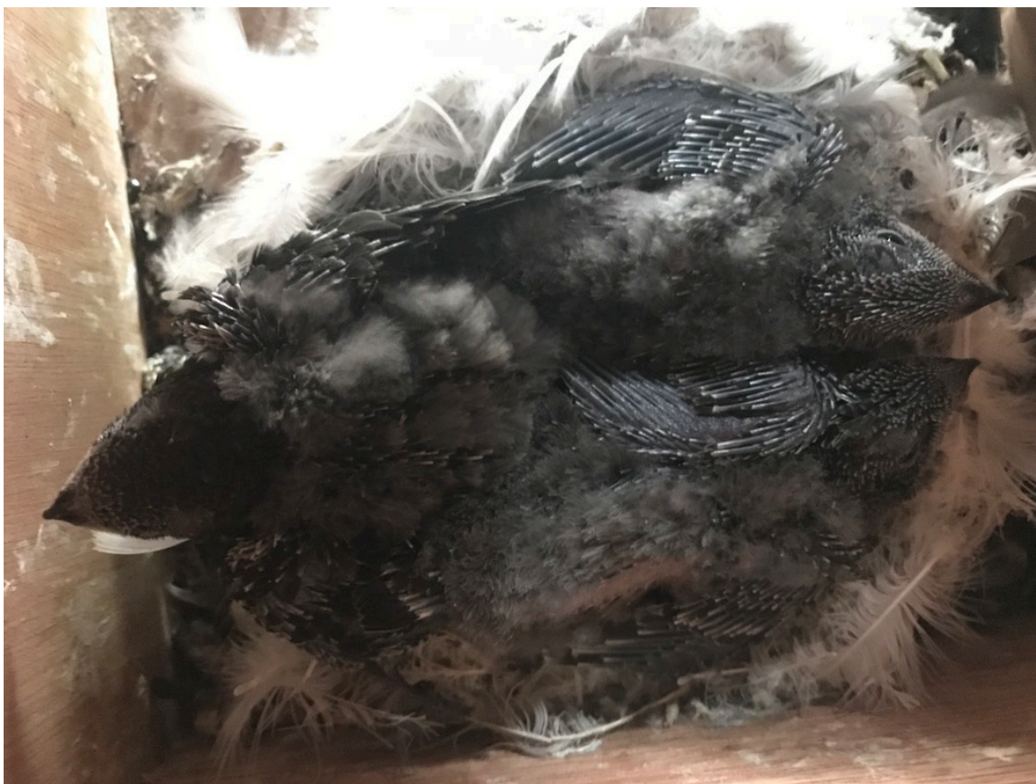
Three healthy young swifts in a church nest box, Summer 2021 St John's, Bury St Edmunds The beak of one bird can be seen on the left and of the two others on the right