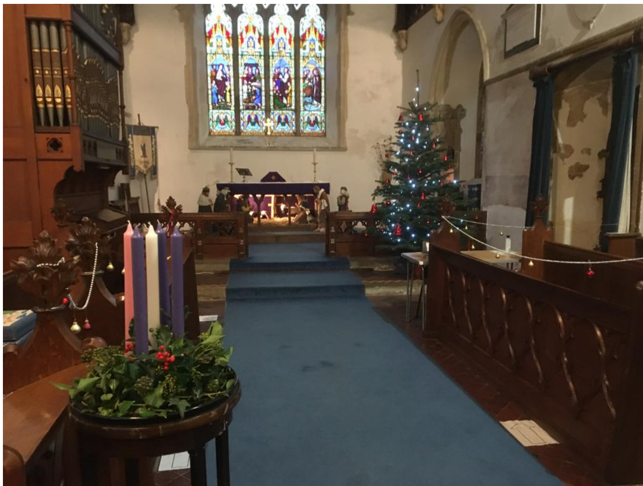
St Mary's, West Stow